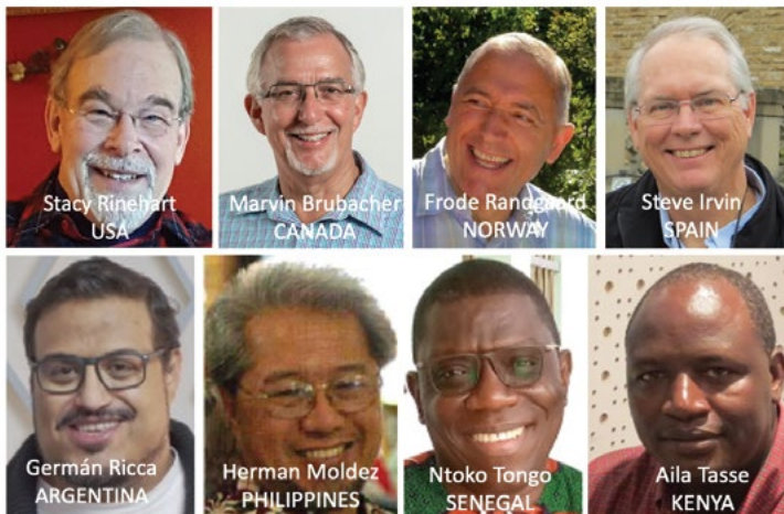
ML GLT March 22

Round Table Fellowship (RTF) – The RTF consists of 40+ selected “elders” of the ML Movement. We met online on March 29 to continue building relationships and explore future opportunities to serve God worldwide.