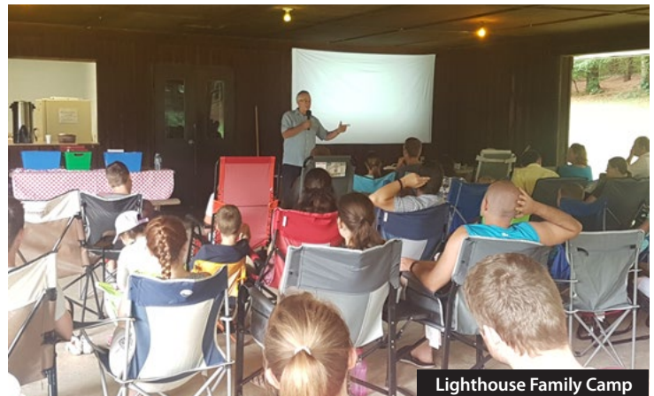
Lighthouse Family Camp