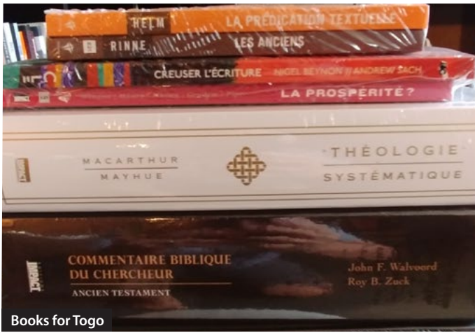
Books for Togo