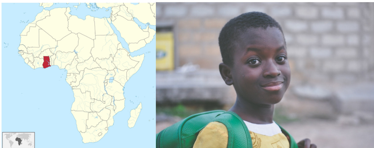
Above (left to right): Map of Africa highlighting Ghana 4 , A Ghanaian student.